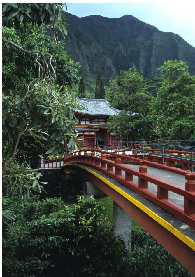
Broydo Inn Temple