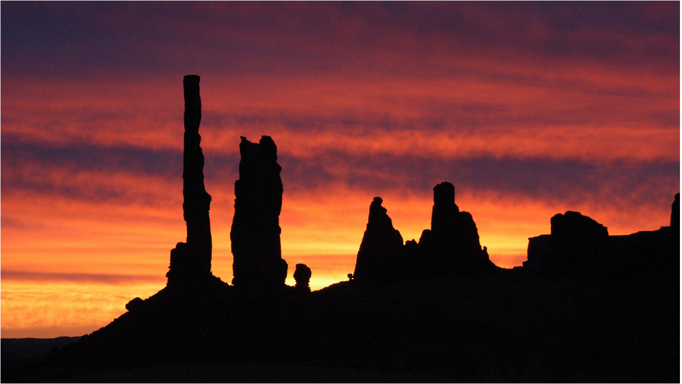
Totems at Sunrise