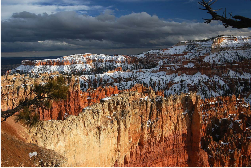
Bryce in Winter #2