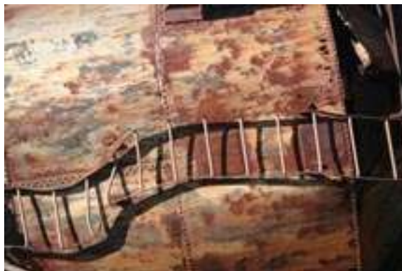
Nov Maui

August 2008 Wailoa Center Abstract Only. Submit art August 2 10am-2pm. Plenty of time to see how abstract we can all be.