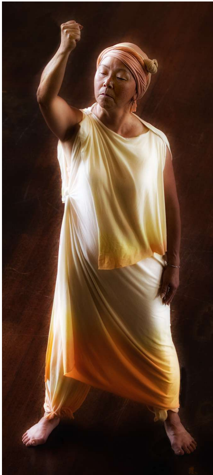
Dance 2

Pow wow was another great photo opportunity. If you haven't been to this event, go next year.