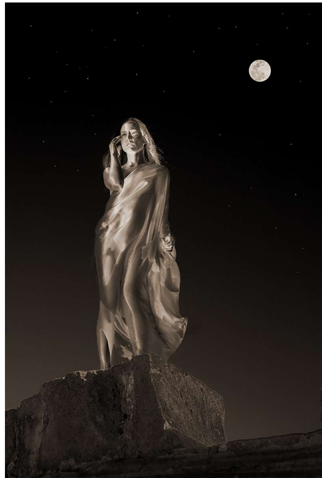
Artemis

Congratulations to all of you who have work accepted in the